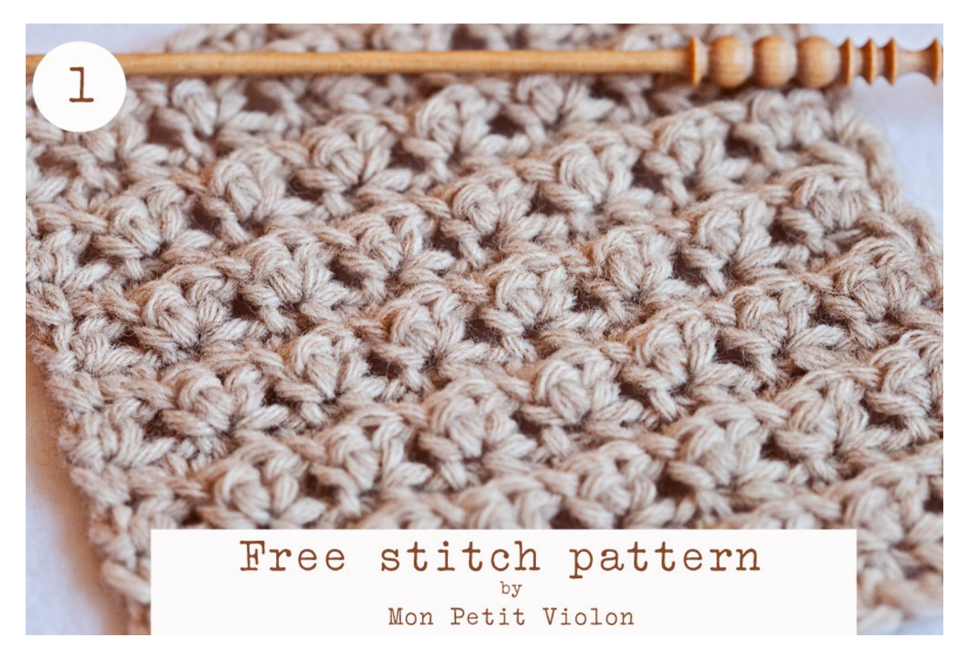
\mbox{\bf Note} - Ch1 at beginning of row doesn't count as first st

Row 1: ch a multiple of 3, sc in 2<sup>nd</sup> ch from hook, *ch1, skip next 2ch, 2sc in next ch*, repeat from * to last ch, sc in last ch, turn